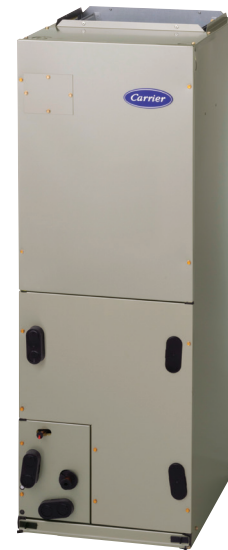
FJ4 Fan Coil